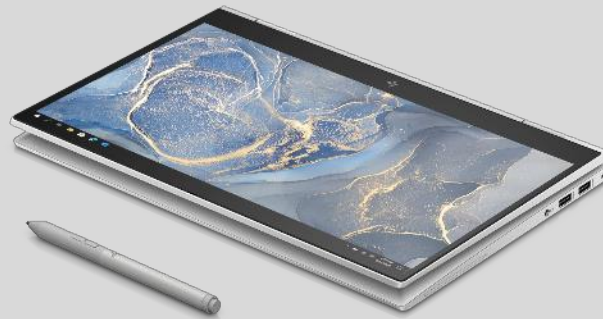
x360 830 G8