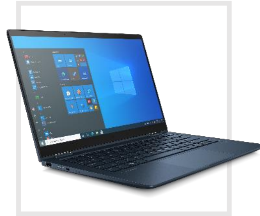
HP ELITE DRAGONFLY G2