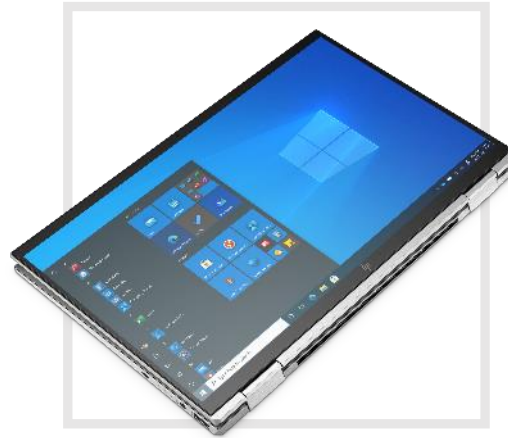
HP ELITEBOOK x360 1030 G8