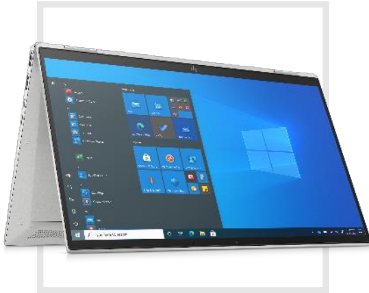
HP ELITEBOOK x360 1040 G8