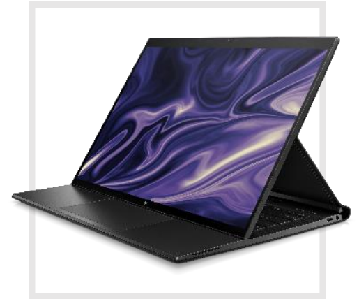
HP ELITE FOLIO 2-IN-1